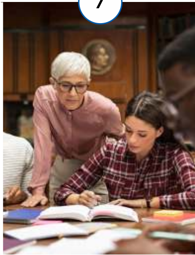
Student Support and Mentorship