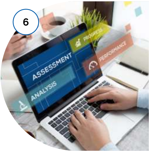
Assessments and Feedback