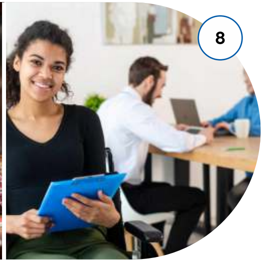
Career Counseling and Guidance