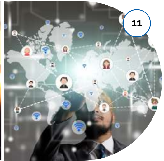
Community and Networking