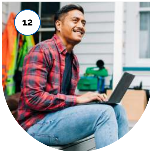
Flexible Learning Options