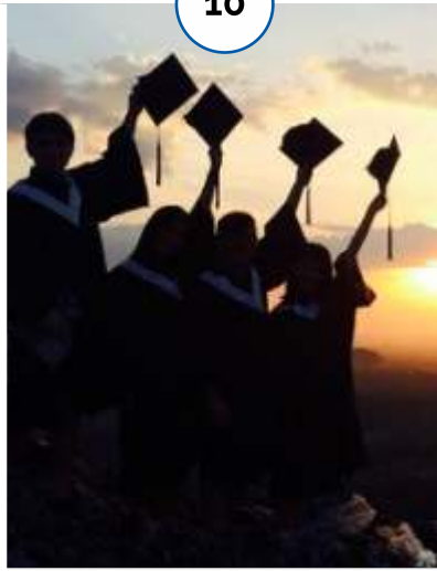
Alumni Success Stories